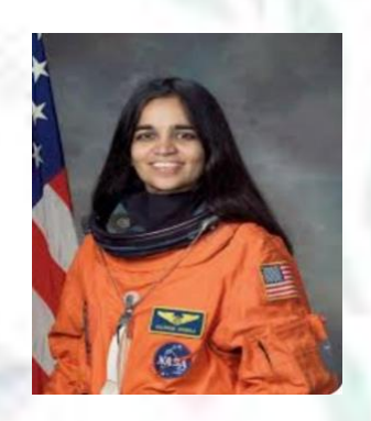
Q7. Identify the following pictures and write their names.